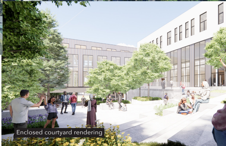
Enclosed courtyard rendering