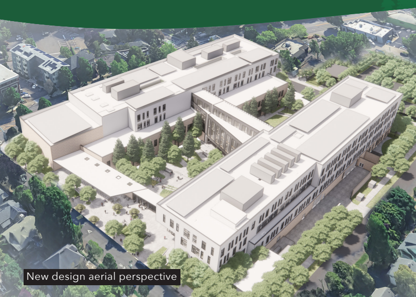
New design aerial perspective