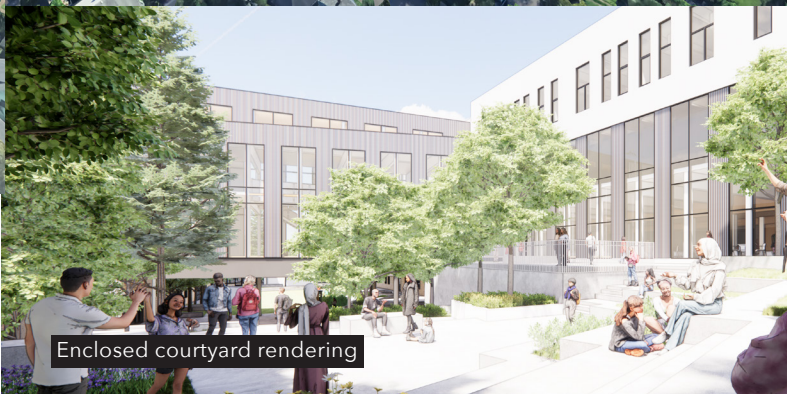
Enclosed courtyard rendering